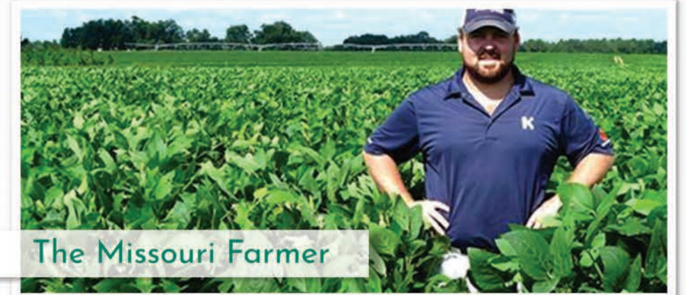
The Missouri Farmer