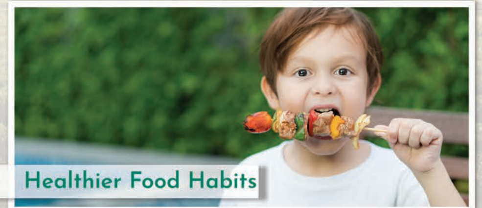
Healthier Food Habits

With this new industry come jobs and opportunities that otherwise would not exist in Central Missouri. As Moberly Natural Crush establishes its successful niche, it is our goal to bring more niche marketplaces to Missouri, and continue leveraging our state's natural food advantages.